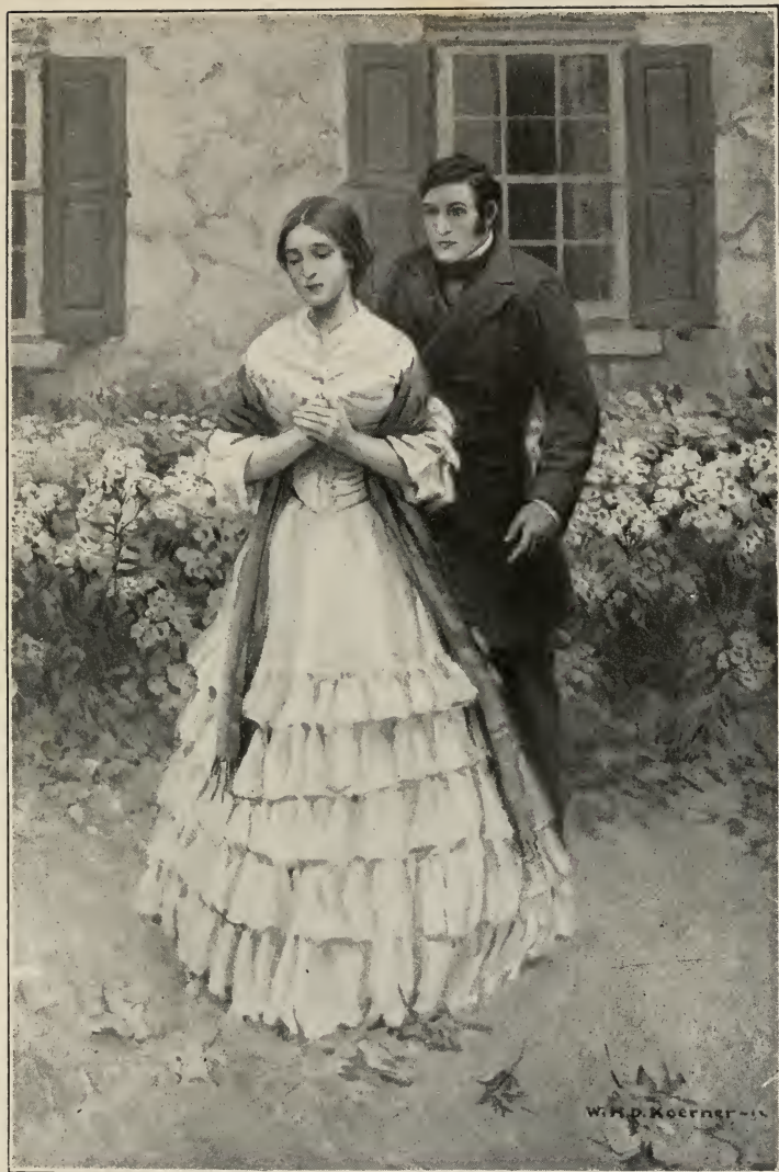
THE BLOW OF HER REPLY ALMOST KNOCKED HIM BACK INTO HIS MINISTERIAL AFFECTATIONS